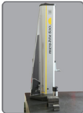
Micro Hite 2D Measuring System