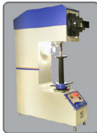
Vickers & Brinell Hardness Tester